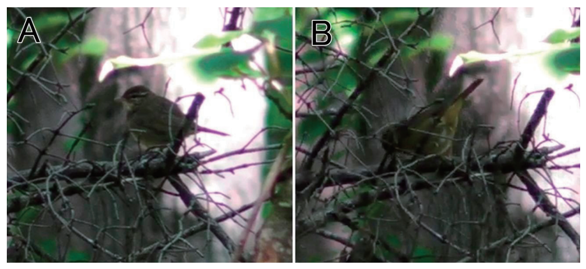
Photo.1. Still photographs from a video clip of a Radde's Warbler taken on 28 May 2008, showing typical color pattern of the supercilium (A) and characteristic color of the under-tail covert (B).